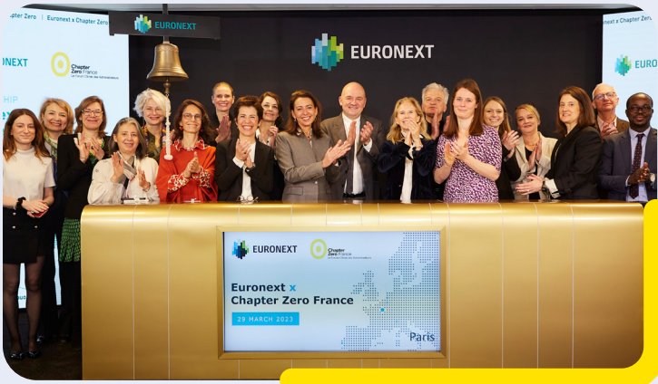
Chapter Zero France opens trading at Euronext