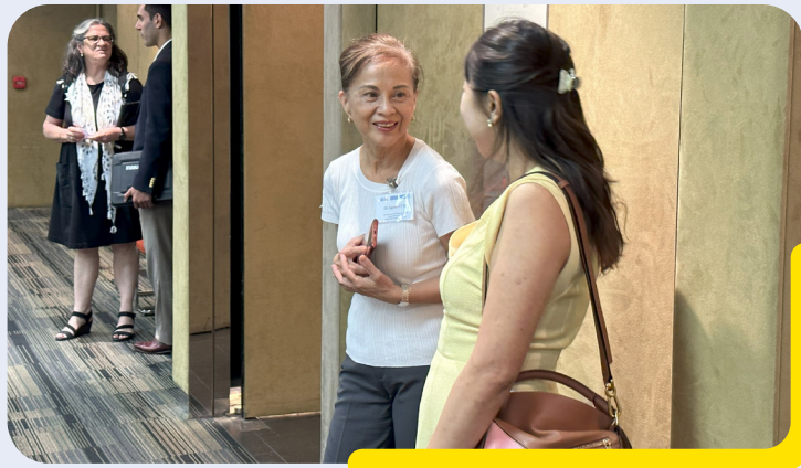
Climate Governance Initiative Hong Kong Pre-COP28 Race to Transition event