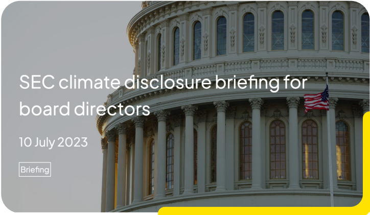
Securities and Exchange Commission briefing