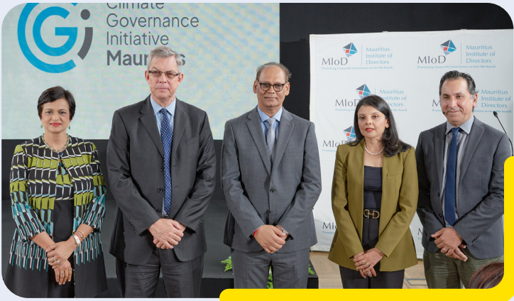
Launch of Climate Governance Initiative Mauritius