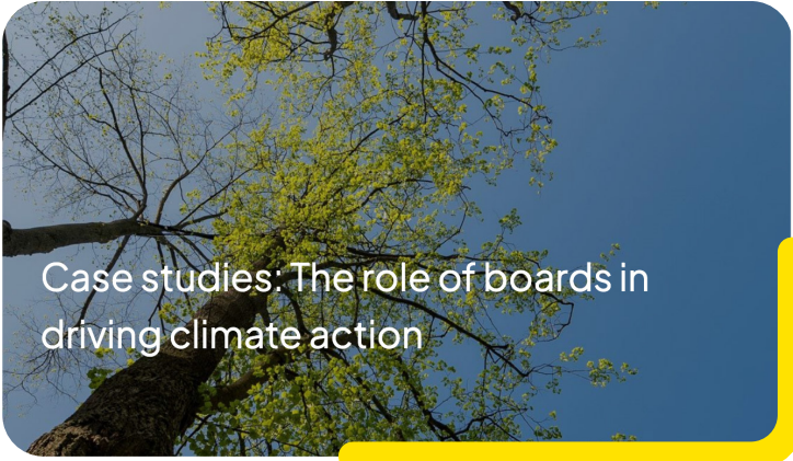
Growing collection of case studies