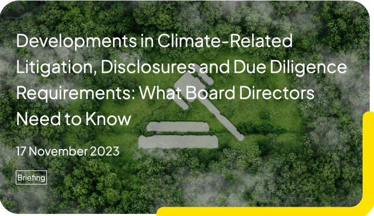
Regular updates on climate-related litigation, disclosures and due diligence requirements