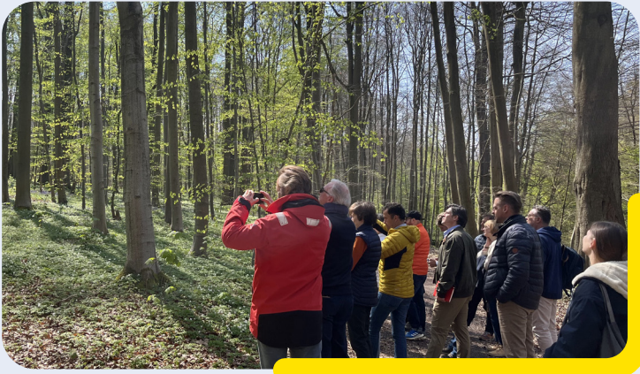
Chapter Zero Brussels climate course for directors in progress