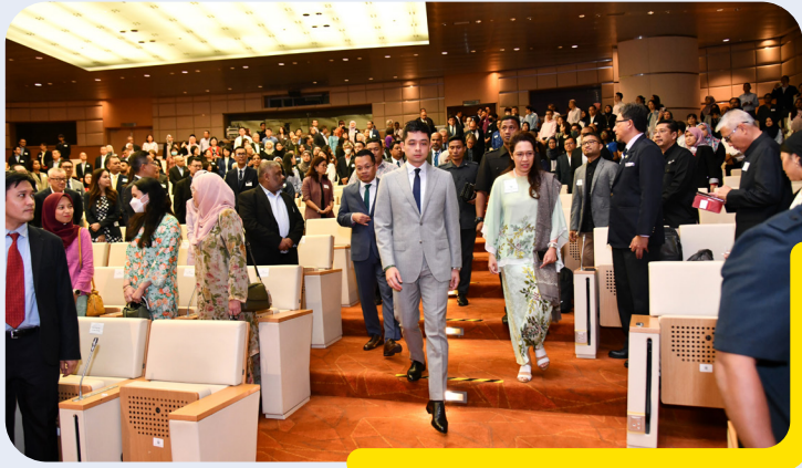
National Climate Governance Summit 2023 run by Climate Governance Malaysia