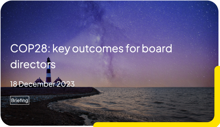
COP28 briefing notes