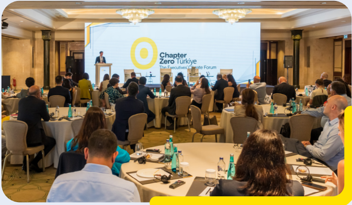
Chapter Zero Türkiye in-person workshop