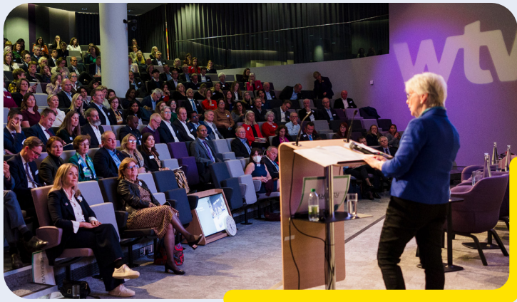
Chapter Zero (the UK Chapter) launches the Transition Plan Taskforce toolkit