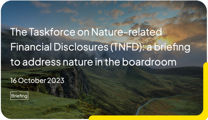
The Taskforce of Nature-related Financial Disclosures (TNFD) publication briefing