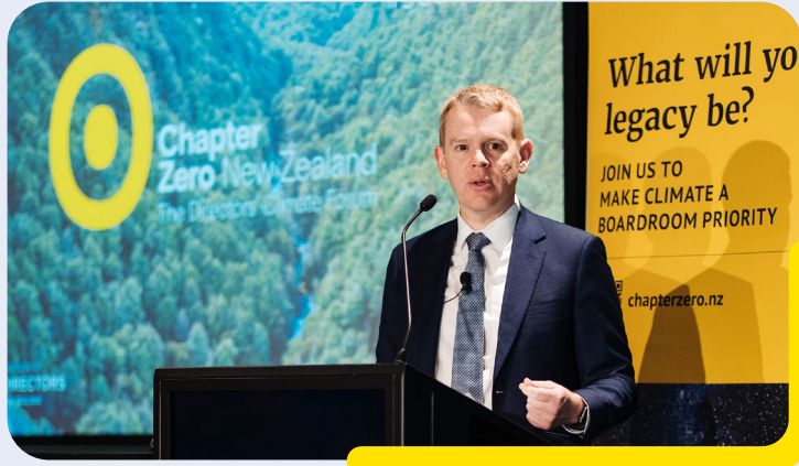
Then Prime Minister Chris Hipkins speaking at a Chapter Zero New Zealand event